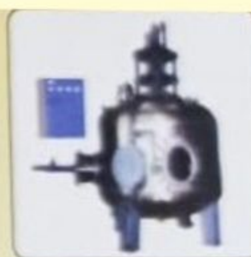
AGITATED NUTSCHE FILTER